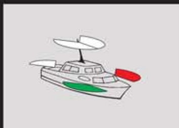
Powerboats up to 20m

1 Masthead lamp 1 Port lamp 1 Starboard lamp 1 Stern lamp