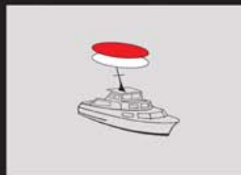
A vessel less than 50m engaged in fishing, other than trawling

1 All Round Red lamp 1 All Round White lamp mounted above one another