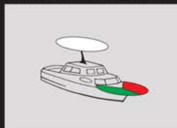
Powerboats up to 12m where Masthead and Stern lamps cannot be mounted

1 All Round White lamp 1 Port lamp 1 Starboard lamp