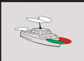
Powerboats up to 20m

1 Masthead lamp 1 Bi-colour lamp 1 Stern lamp