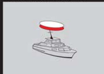
A vessel engaged in pilotage duty

In addition to Port, Starboard, Masthead and Stern lamps 1 All Round White lamp 1 All Round Red lamp mounted above one another