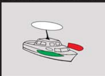
Powerboats up to 12m where Masthead and Stern lamps cannot be mounted

1 All Round White lamp 1 Port lamp 1 Starboard lamp