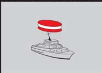
A vessel engaged in diving operations

1 All Round Red lamp 1 All Round White lamp 1 All Round Red lamp mounted above one another