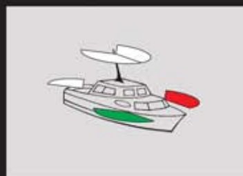
Powerboats up to 50m

1 Masthead lamp 1 Port lamp 1 Starboard lamp 1 Stern lamp