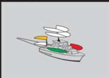
Powerboats towing with a tow length of less than 200m

In addition to Port, Starboard and Stern lamps 1 Towing lamp mounted above the stern lamp 2 Masthead lamps in a vertical line (When the tow length exceeds 200m, three Masthead lamps in a vertical line)