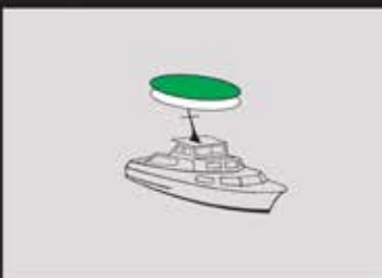
A vessel less than 50m engaged in trawling

1 All Round Green lamp 1 All Round White lamp mounted above one another